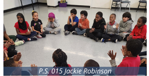
P.S. 015 Jackie Robinson