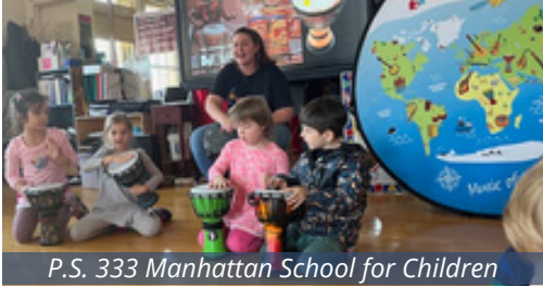
P.S. 333 Manhattan School for Children