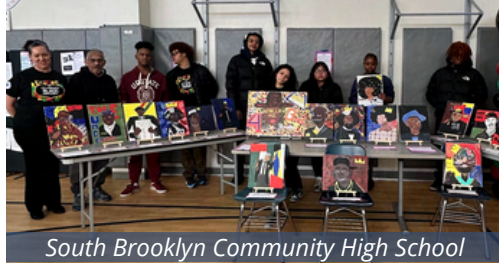
South Brooklyn Community High School